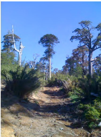
The magnificent Araucarias trees in the reserve

big help in the field as well as in the office. In the future we face important challenges that require hard work to assure the long-term success of the Nasampulli reserve. These in-