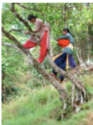
Planting epiphytes on trees

One of the sanctuary's more recent projects, supported by Rainforest Concern, is the Rapid Floristic Survey covering the southern-forested districts of Maharashtra, Uttara Kannada, Coorg, Nilgiris and Wayanad. As well as monitoring the growth and spread of Orchidaceae, Balsaminaceae and Pterophytes the project continues to foster the ongoing cultivation and propagation of approx 1,600 native rainforest species. In addition to this Rainforest Concern has also provided funding for the purchase and replanting of an old coffee plantation.