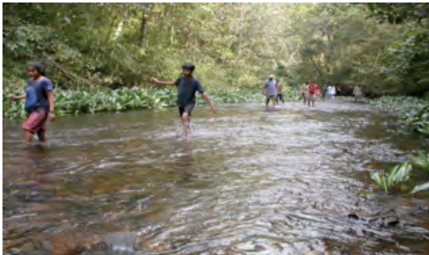
Restoration of hillsides ensures clean and healthy streams

Various areas of the Sanctuary have been landscaped to create microhabitats for those plant species that are particularly vulnerable and difficult to cultivate. This included the construction of two greenhouses, one for seed and seedling storage, the other for ground orchids and impatiens. And together with the Tamil Nadu Forest Department we are continuing to restore the wattle infested areas of the Mukur-